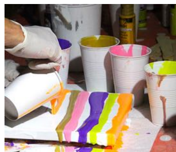
Paint stripes, then swipe

2nd was the "swipe" method. She poured the paints in a stripe pattern across the canvas (at left), leaving a bit of white space between the stripes. She then took a damp paper towel and drew it down the canvas, and after some thought, drew the towel back over the canvas from the opposite direction. She had added silicone to the paints which developed interesting "cell" activity patterns as it settled and dried—Cool!