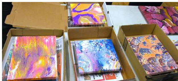
4 finished panels!