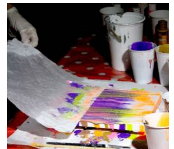
Swipe with damp towel

2nd was the "swipe" method. She poured the paints in a stripe pattern across the canvas (at left), leaving a bit of white space between the stripes. She then took a damp paper towel and drew it down the canvas, and after some thought, drew the towel back over the canvas from the opposite direction. She had added silicone to the paints which developed interesting "cell" activity patterns as it settled and dried—Cool!