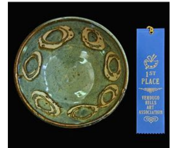
1st Place Sculpture

To see more images from the Small Image Show double click this link Small Image Show 2017 or visit our website at www.verdugoarts.org , and select “member art”, then “curent VHAA shows”, then “small image show.”