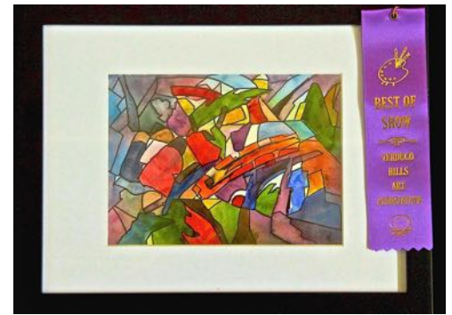
Best of Show