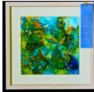
1st Place Non-representational