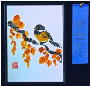
1st Place Representational