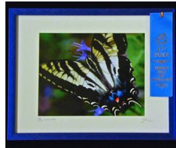
1st Place Photography