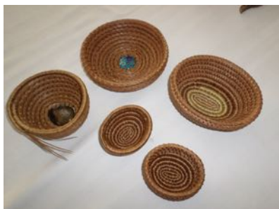
Some with solid bottom, some coiled

You can also make the basket just with coiled pine needles, but using a leather, wood or other round bottom to start is easier until you have the technique. It requires really very simple tools and supplies, a bit of preparation—like any art or craft—and of course, practice! But coming away from the meeting I felt it was very doable, which is always a good feeling after being exposed to something new. Shelley is not only a fabulous teacher, she's also an amazingly creative artist doing things outside the box (or basket)! To learn more about Shelley, or sign up for classes visit her website at www.pineneedlebasketryandgourdart.com .