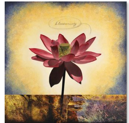
Mixed media acrylic and collage on 3/4" wood panel