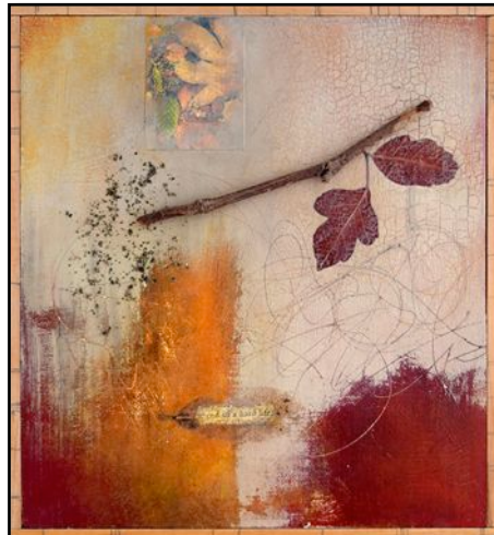
Mixed media collage and found objects on up cycle wood