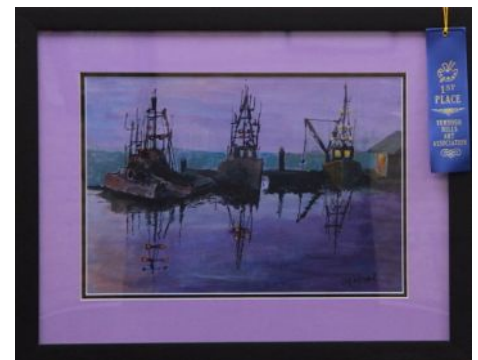
First Out Grant Wood