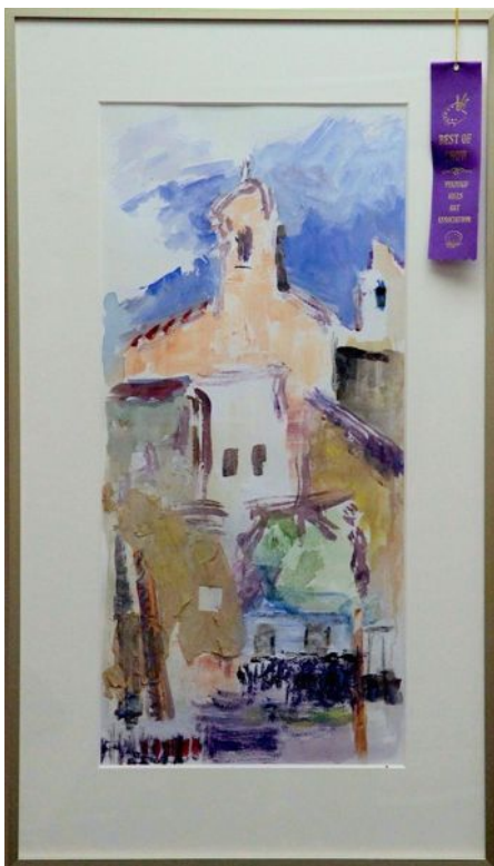
Backstreet View David McCully