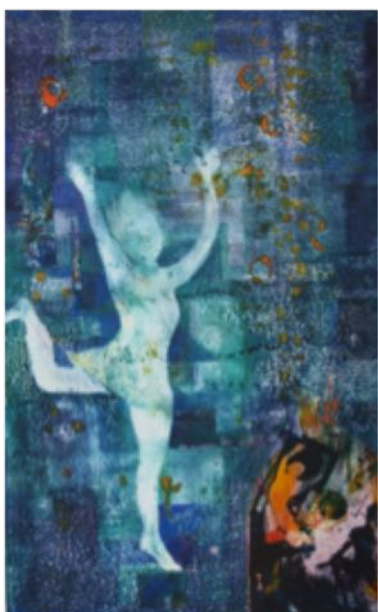
Fun and Games Monoprint/ Collage

December 14, 7:00pm at the La Canada Community Center, 4469 Chevy Chase Dr.